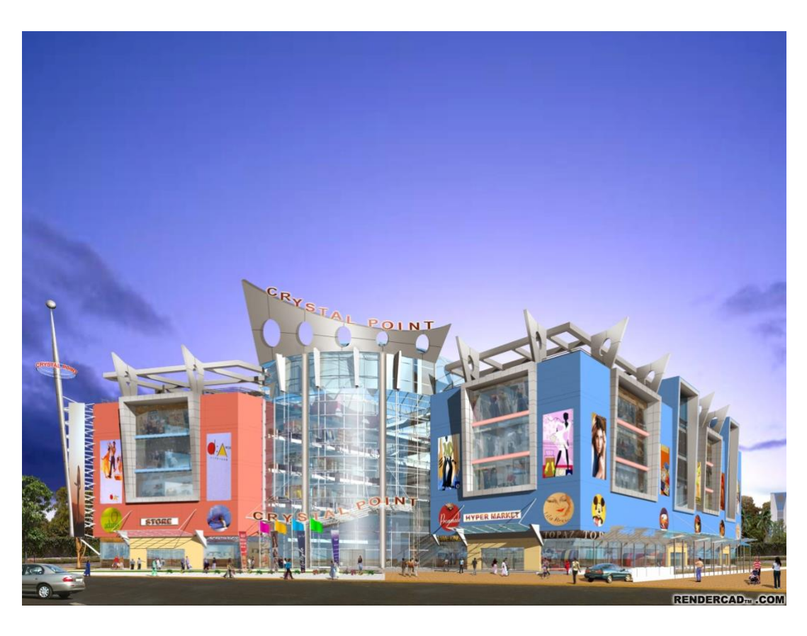
CRSTAL POINT MALL AT LINK ROAD , ANDHERI FOR HARSH KAUSHAL DEVELOPERS