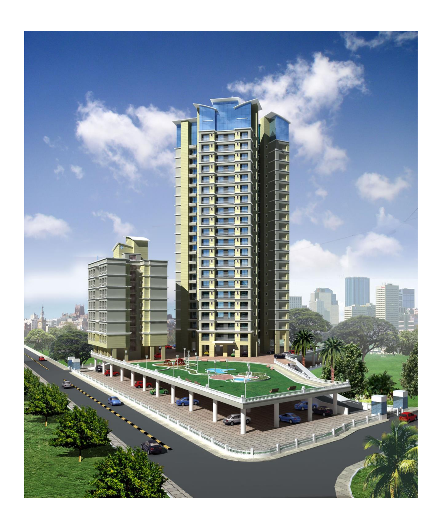
RESIDENTIAL PROJECT AT JOGESHWARI (W) FOR SURTI DEVELOPERS