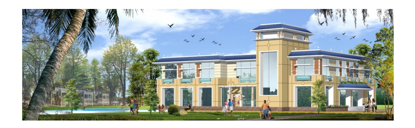
CLUB HOUSE AT LOKHANDWALA, ANDHERI FOR AJMERA BUILDER