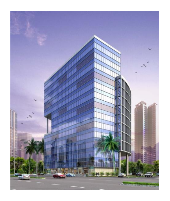
COMMERCIAL BUILDING AT GHATKOPAR