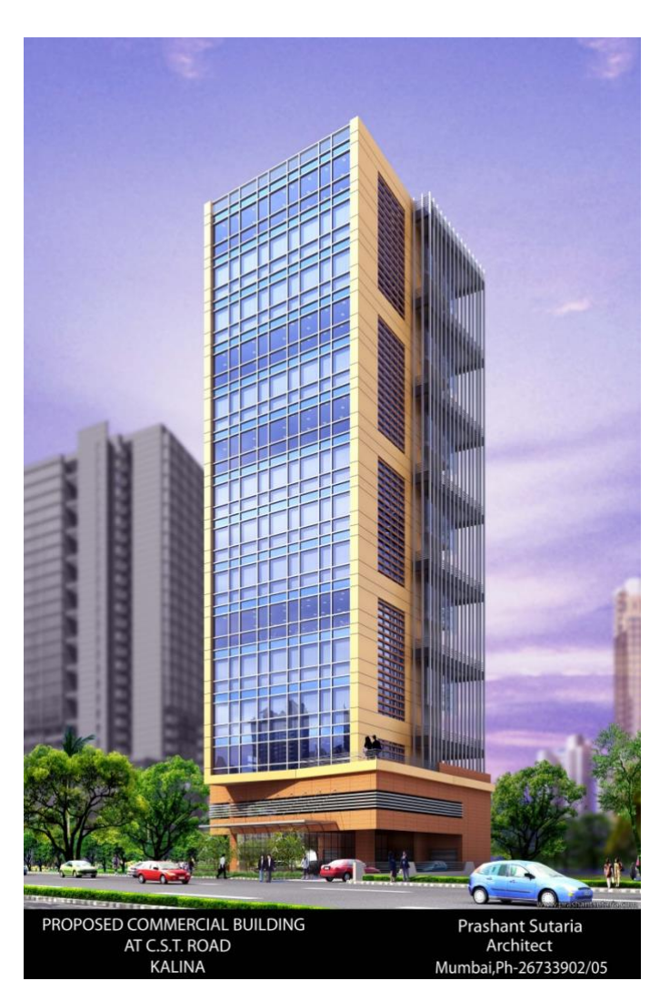
COMMERCIAL BUILDING AT KALINA FOR AJMERA BUILDER