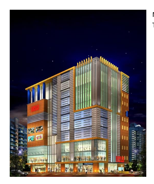
MALL AT GHATKOPAR FOR DATAR SIR (OLD UDAY TALKIES)