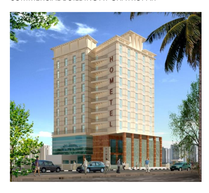
HOMETEL HOTEL AT MALAD (W) FOR JAGMOHAN ARORA