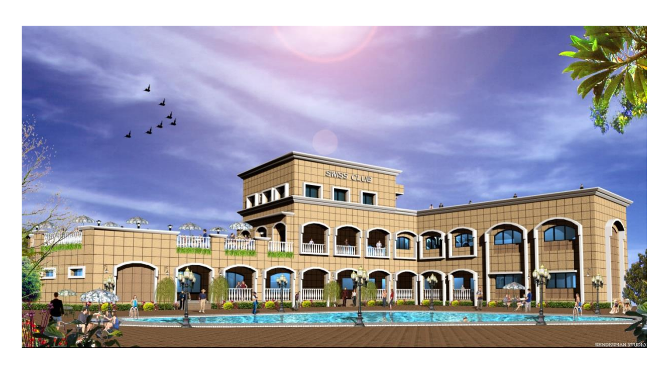
CLUB HOUSE AT LOKHANDWALA, ANDHERI FOR AJMERA BUILDER